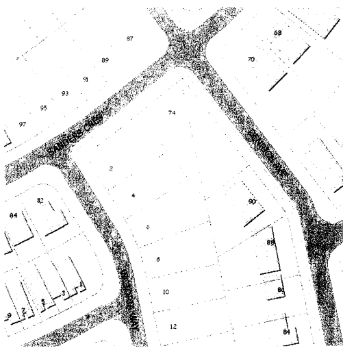
Site Map SCALE: Reference