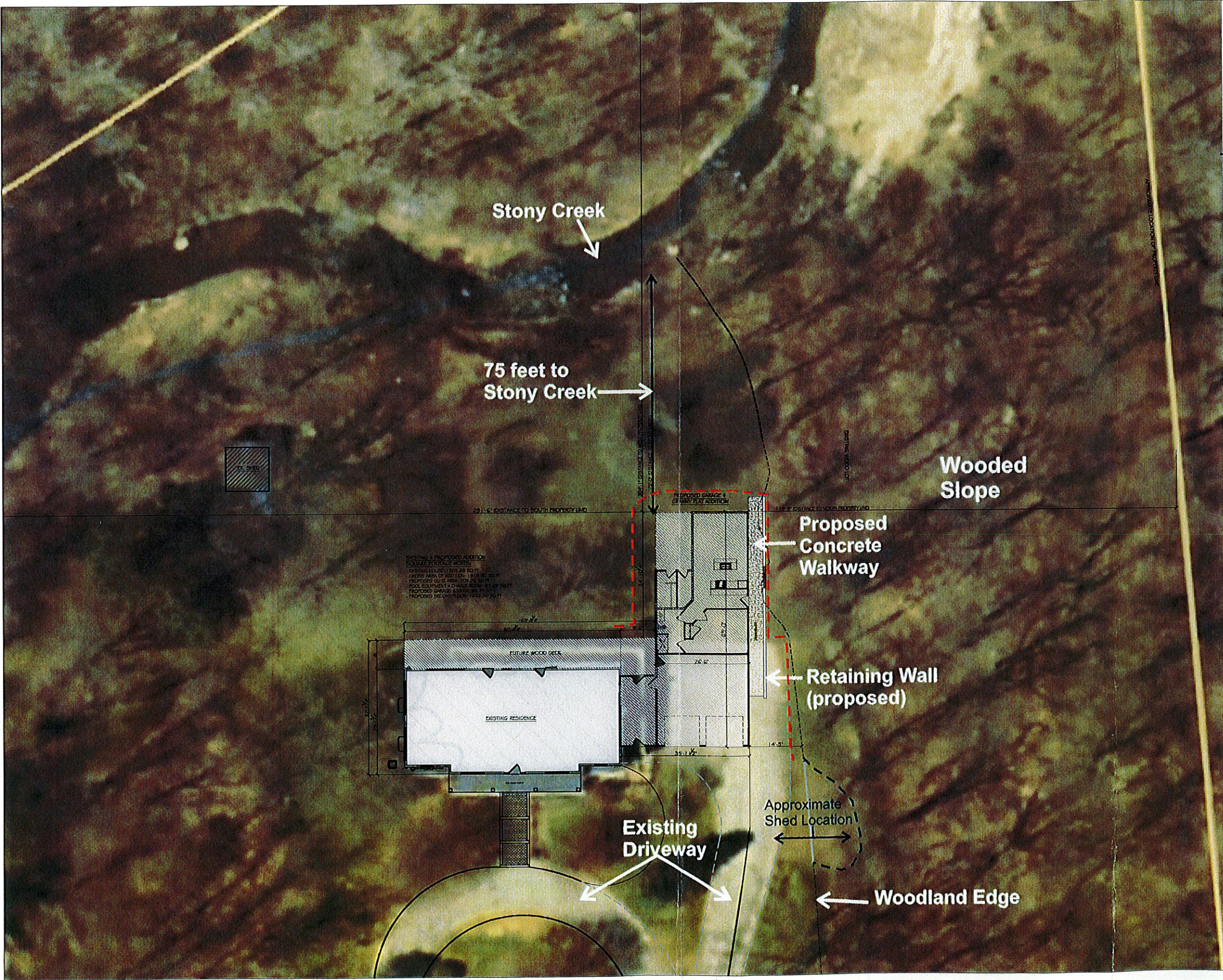
FIGURE 1. Proposed Addition.