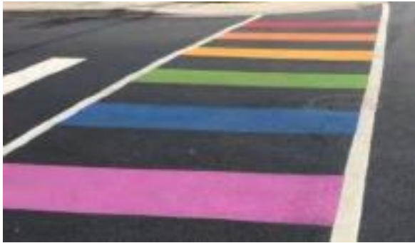
Figure 1: Multi-coloured 'ladder' pattern