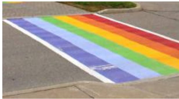
Figure 2: Multi-coloured 'longitudinal' pattern

Based on these two (2) “standards”, as defined in the OTM, the proposed rainbow crosswalks provide minimal risk if installed as prescribed in the OTM for ladder or longitudinal crosswalks. However, to mitigate future operational cost and in consideration to crosswalk “uniformity” in light of current patterns; Town Staff is recommending the institution of Figure 1 the multi-coloured 'ladder' pattern.