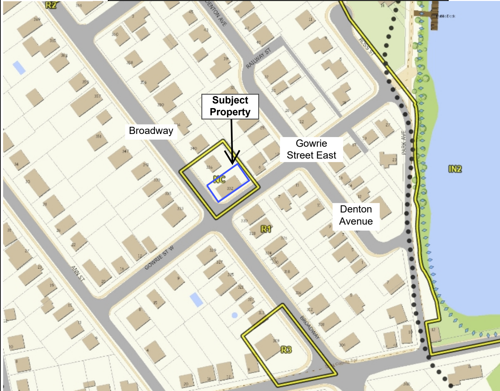
Plate 1: Location Map with Existing Zoning File No: ZN 7-23-03 - Ford LT 616 PL 500; PT LT 615 PL 500 AS IN 229659; 332 Broadway, Tillsonburg