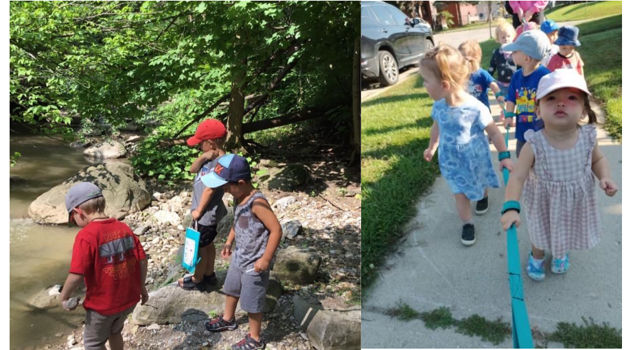
Nature Walks and Community Walks