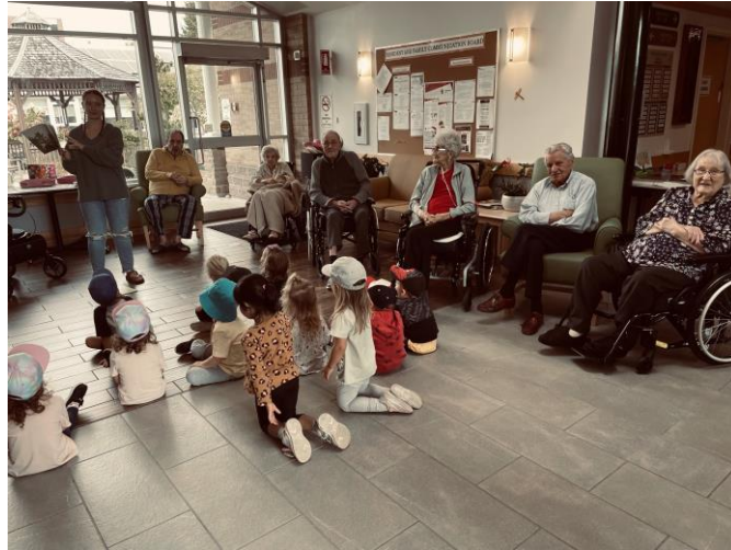
Visiting 'Grandmas & Grandpas' at Maple Manor, Woodingford Lodge, Tillsonburg Retirement Center & VON