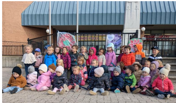
Remembrance Day Ceremony