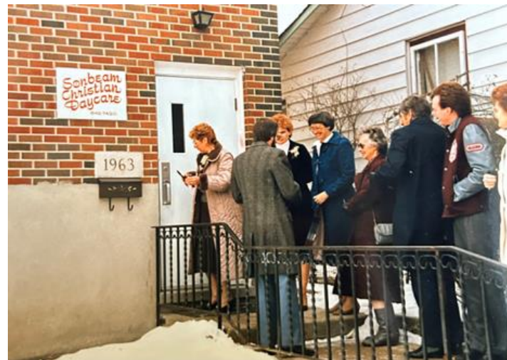
Grand Opening Ceremony January 1987