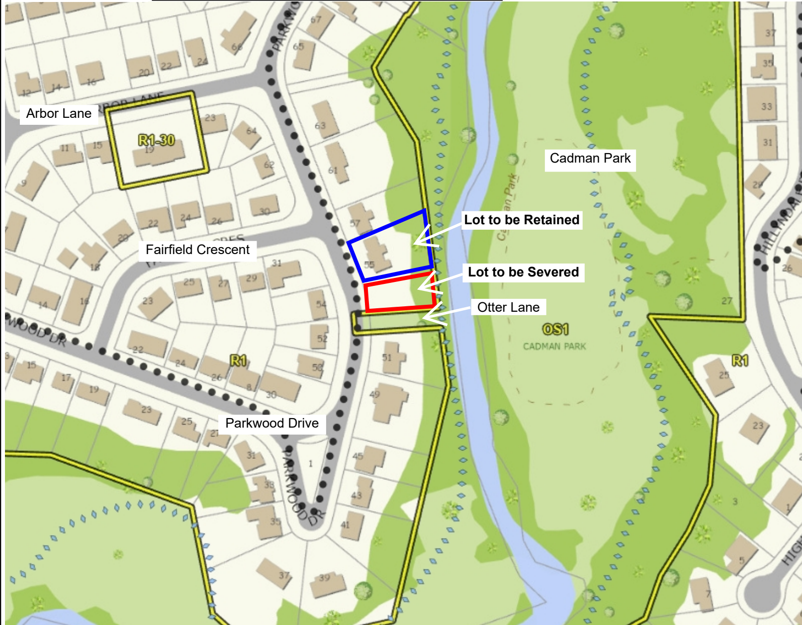
Plate 1: Location Map and Existing Zoning File No. B24-47-7 (McKnight) LT 31-32 Plan 507, 55 Parkwood Drive