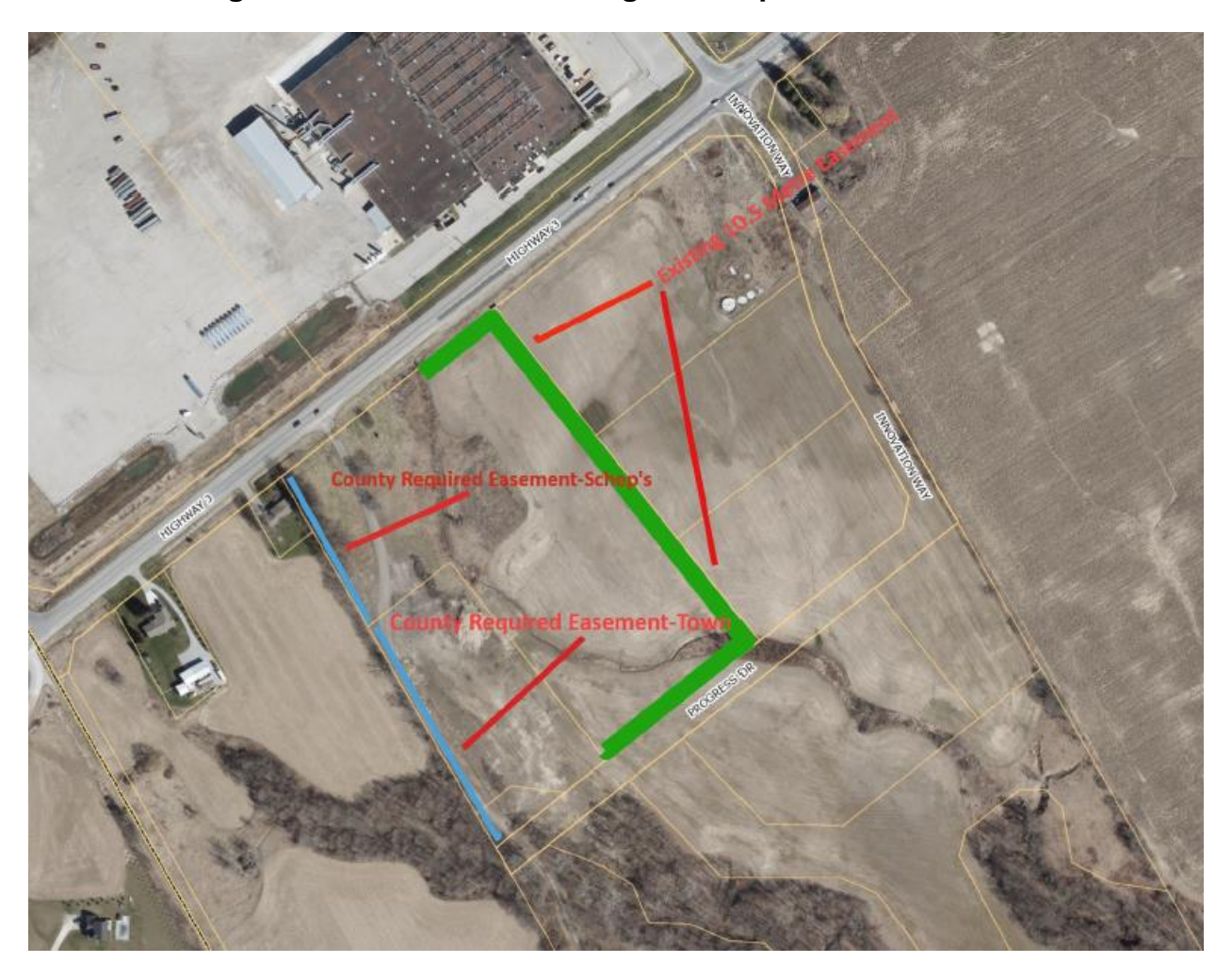
Figure 1 – Location of Existing and Requested Easements

The Site Plan approval process allows for public authorities to request easements through the process. Typically, this would be with the property owner only, but in this case, the easement is required to connect through the Town's property at 1040 Progress Drive (the "Snow Storage" lands) and the County has requested that the Town provide the corresponding easement at this time as well. This is arguably something that should have been identified through the 2011 Plan of Subdivision process. As the Town is the developer of the Van Norman Innovation Park, Economic Development & Marketing staff will be coordinating with the private developer (Schep's) to meet the requirements of the County.