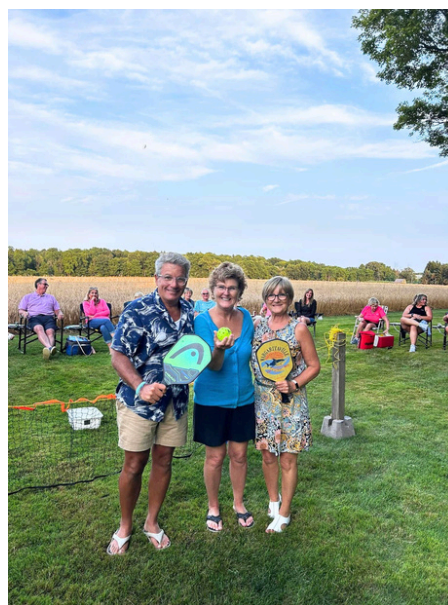
Club social events