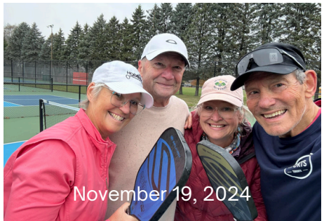
Last day of the 2024 Season