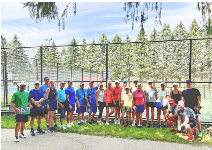
Participants at one of the summer tournaments

14. Junior Pickleball Coaching- We are providing free coaching to the junior Pickleball Programs held at Westfield Public School in partnership with the Town of Tillsonburg's Recreation Department in Spring 2025.