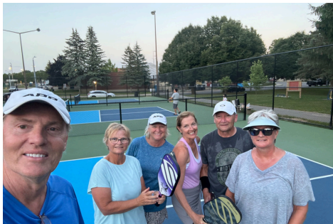
Free lessons for members

It's not talked about much but pickleball or the availability of pickleball in a community has become a deciding factor for people wanting to move somewhere new and out of the city. Tillsonburg has already proven itself to be ideal for anyone wanting to move somewhere new and exciting, safe, clean, filled with activity and possibility. More pickleball courts will certainly make Tillsonburg even more viable as the perfect place to live in Canada!