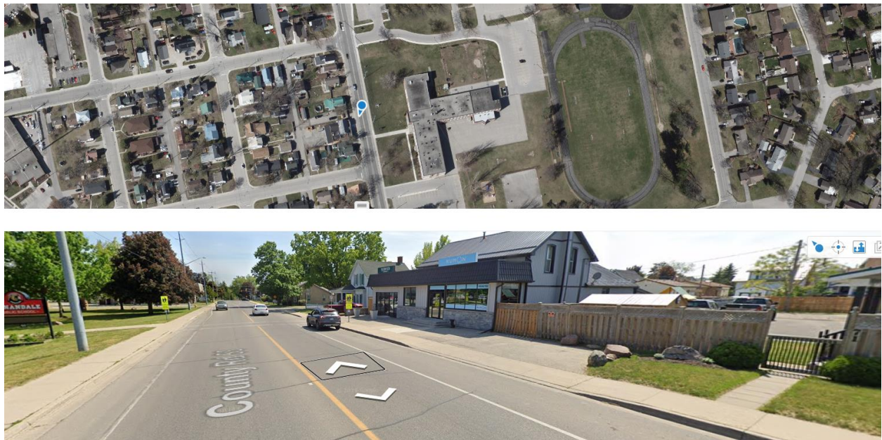
Figure1. Aerial and street view of the current pedestrian crossing.

Through recent Transportation Planning, Oxford County staff have identified the need to upgrade the pedestrian crossing at Annadale Public School, located on Tillson Avenue (County Road 53). This initiative is essential to enhance public safety for pedestrians, particularly students. Aerial and street view (looking south) of subject location below: